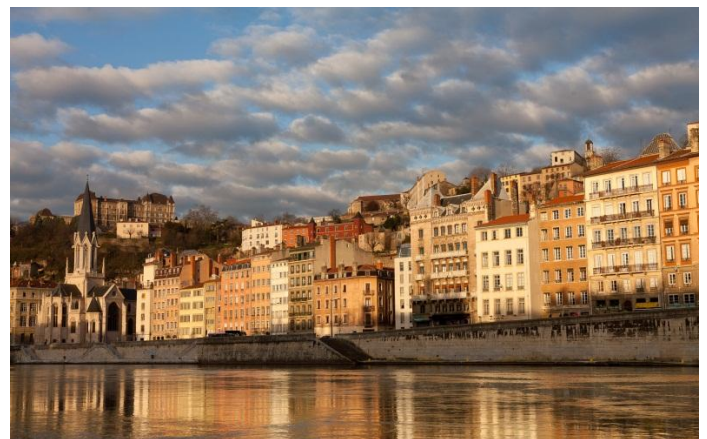
The Saône Quays