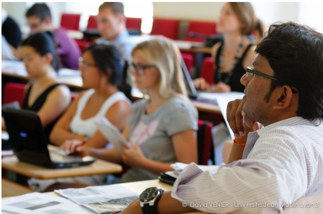
International Students, Manufacture des Tabacs Campus

At the heart of the Rhône-Alpes region, itself committed to international development; Jean Moulin Lyon 3 University aims to support the ongoing development of incentive schemes (e.g. inbound and outbound regional mobility grants).