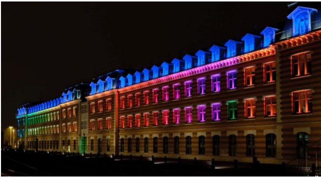
Manufacture des Tabacs Campus

*Study abroad programs are Bachelor and Masters courses taught in French that take place in various partner institutions abroad.